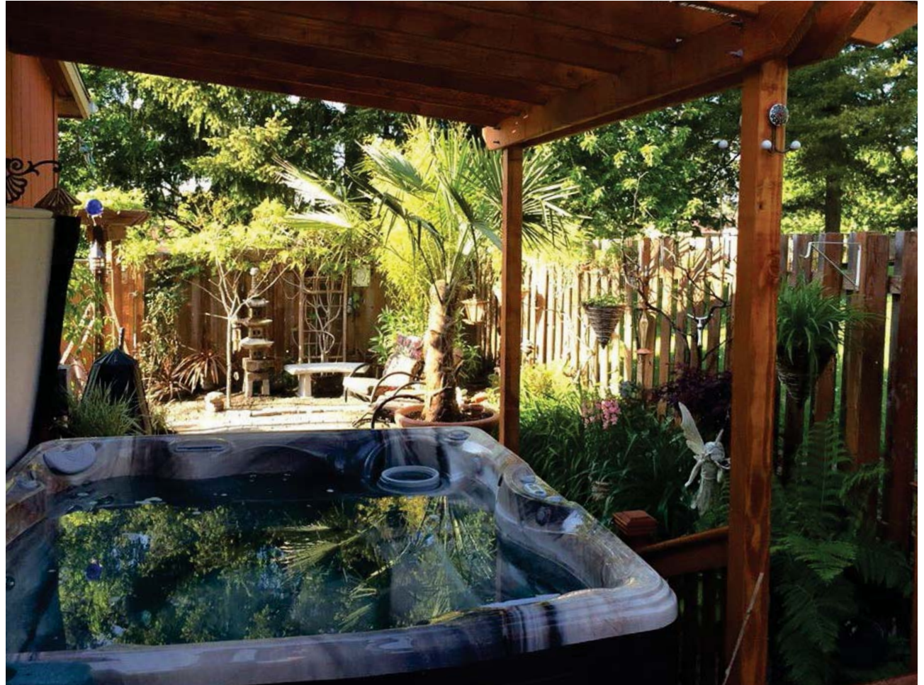
Bobbie | Lafayette, OR

We're delighted when Caldera spa owners express how much their hot tub means to them. And we're proud to create a product that helps people develop daily habits that foster personal well-being and positive change.